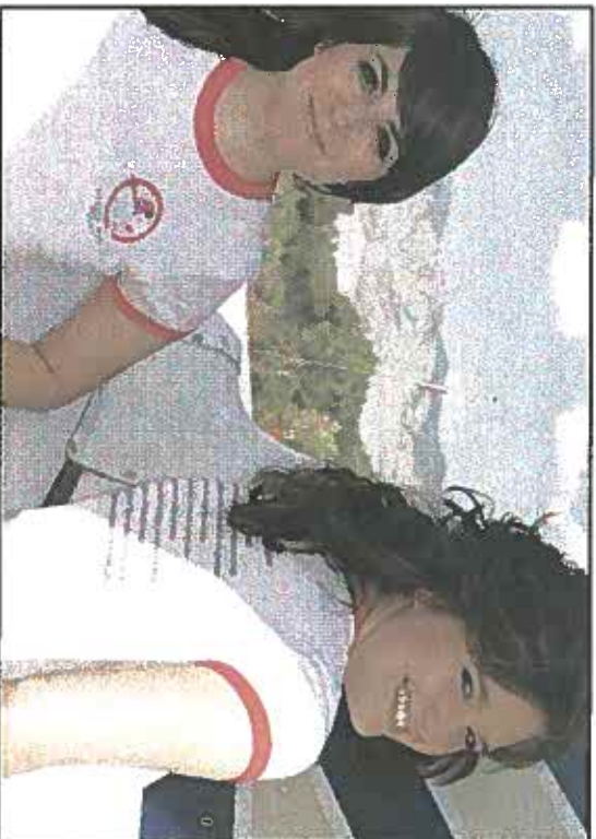
COOL T-SHIRTS with the distinctive logo are available.

For female flyers of the present, Powder Puff Pilot offers pink headsets, a pink pilot log-book and T-shirts to assert their femininity in the cockpit. There are books for career advice, like Flight Guide for Success by Karen Kahn, as well as ball caps, polos, microfleece vests and scarves to outfit any aviatrix with a touch of pink. For pilots of the future, there